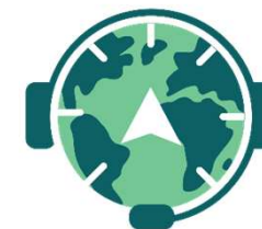
On-Call Success WorldStrides 24-hour support